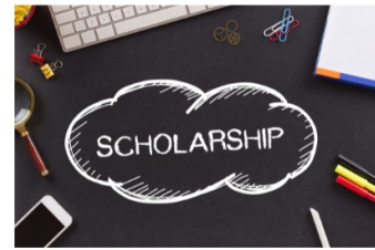
2024 Scholarship Recipients

The Jim Boyce Memorial Scholarship Committee is excited to announce the recipients of the 2024 scholarships. Each recipient has been granted $2,000 to support their educational pursuits. The JBMS Committee expresses gratitude to all the applicants for their submissions and extends heartfelt appreciation to the generous donors who contributed to the scholarship. If you wish to make a donation, you may do so on our webpage .