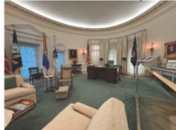
2 1/2 day APA Conference