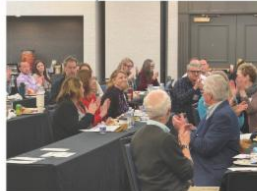
2 1/2 day APA Conference