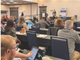
2 1/2 day APA Conference