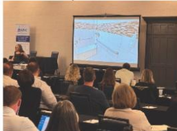
2 1/2 day APA Conference