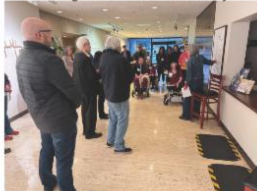
2 1/2 day APA Conference