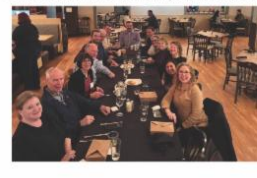
2024 Education & Events Committee