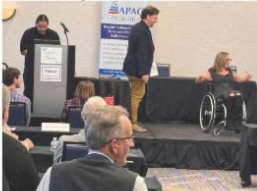
2 1/2 day APA Conference